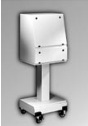
Note: Pedestal, plinth and casters shown in photo are optional.