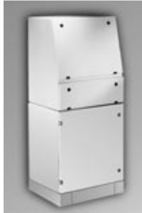
Note: Base and plinth shown in photo are optional.