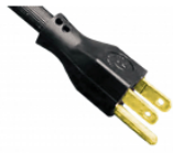
5-15P Straight Blade

Four models each with a different plug type.