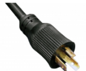
L5-20P Locking Type