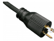
L5-15P Locking Type