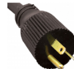
5-20P Straight Blade