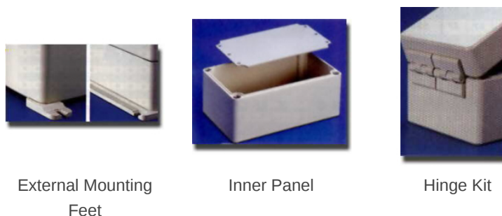
External Mounting Feet