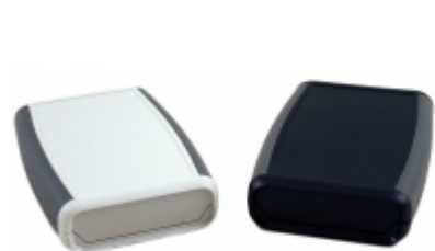
Light Grey or Black Enclosure Color