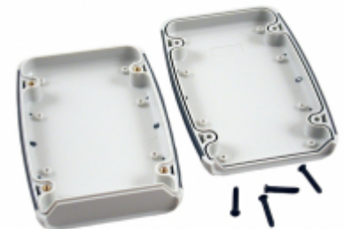
Key Internal Features