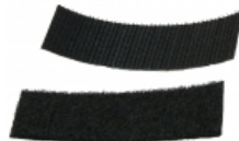
Hook & Loop Mounting Strip 1592ETV