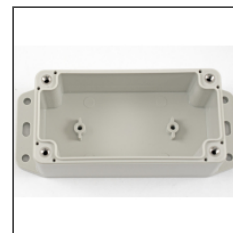
Internal DIN rail mounting point.