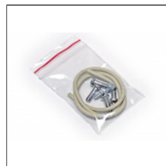
Hardware includes lid screws, PC board screws, and gasket