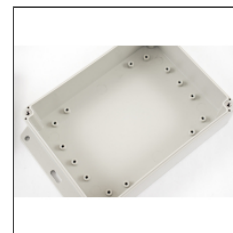
Internal mounting points for PC boards or panels