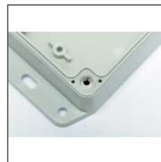
Features corrosion resistant inserts for lid assembly