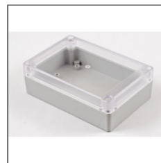
Clear Lid (polycarbonate version shown)