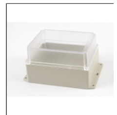
Some models supplied with deep lids.