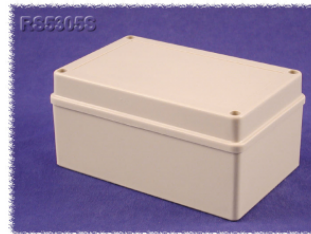
Assembled View (Top)