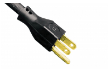
5-15P Straight Blade