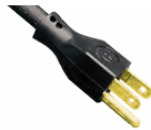
5-15P Straight Blade