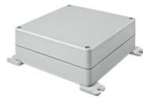
External Mounting Feet