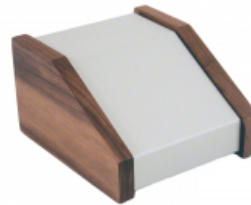
30 degree slope