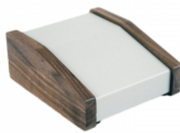
15 degree slope