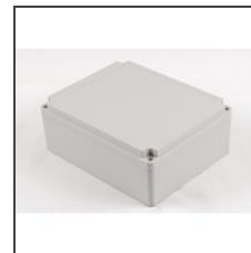
Some models supplied with styled lid.