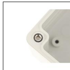
Features corrosion resistant inserts for lid assembly