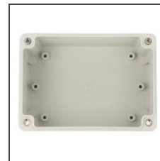
Internal mounting points for PC boards or panels