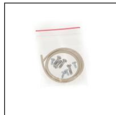
Hardware includes lid screws, PC board screws, and gasket