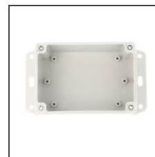
Internal mounting points for PC boards or panels