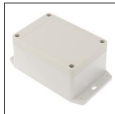
Opaque Lid (ABS version shown)