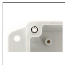
Features corrosion resistant inserts for lid assembly