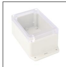
Clear Lid (polycarbonate version shown)