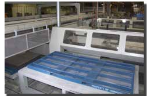
Laser Work Center

Consider the true costs of modifying enclosures at your factory. When you add up prep time, layout, drilling, tapping, cutting, paint touch up, assembly and the extra product handling, you'll see the value in getting an enclosure from Hammond that's ready to load up.