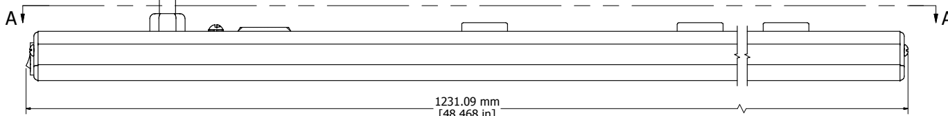
ASSEMBLY - VIEW FROM SIDE