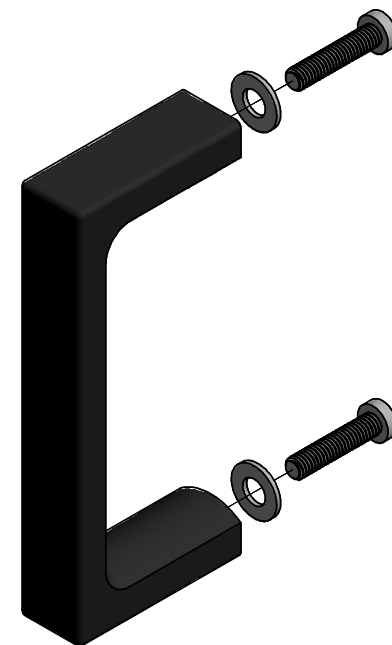
EXPLODED ASSEMBLY VIEW